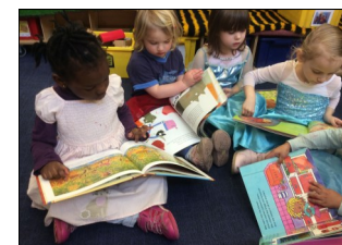
Reading on World Book Day